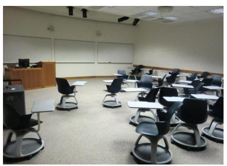
Flexible learning classroom