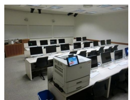
Figure 1: Lecture and flexible learning classrooms