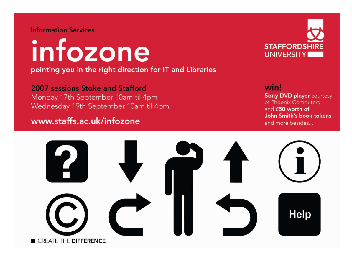
Figure 5: InfoZone induction postcard from 2007 (reverse)